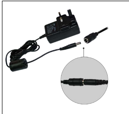
Figure 1: ACR122L Power Adapter

The ACR122L VisualVantage Serial NFC Reader comes with a 7 V power adapter as shown below: