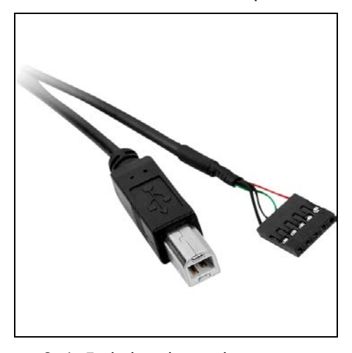
Figure 2: 1x5 pin header socket connector

Another option for the reader interface is the 1x5 pin header socket, where the cable shown in Figure 2 is to be used for connecting to the motherboard of the computer, instead of the USB cable.