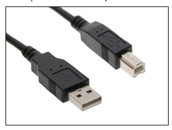
Figure 1: USB A/B cable for ACR38F-A1

The size is the same as a standard 3.5-inch floppy disk drive and there is no plastic cover on top. There are also screw holes on the reader for mounting the device on the computer chassis. For convenience, four (4) pieces of PA 2.6 mm x 8 mm screws are included. A "4-pin mini power socket (M)" is provided on the PCB reader for the power interface (the socket is the same as the one used in a 3.5-inch floppy disk drive) on which the included USB A/B cable, shown in Figure 1 , is to be used for connecting the reader to a USB port on the host computer.